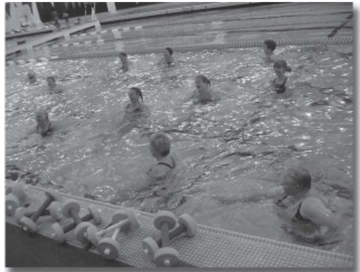
Aquatic exercise splashing it up!