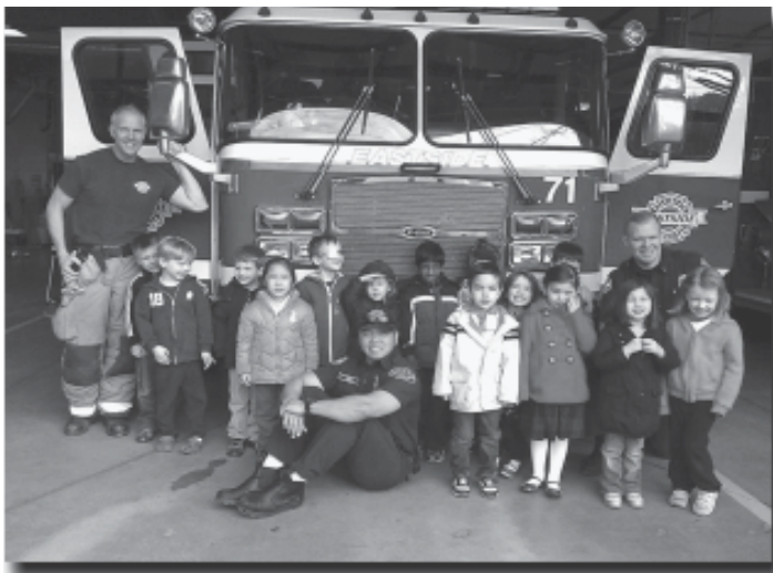
Preschool field trip to the fire station!!!

The inclusion of advertisements in this brochure does not constitute an endorsement or accuracy of the advertisement(s) by the City of Issaquah, for the products and/or services advertised.